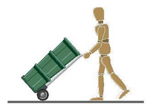
Figure 2 Acceptable push/pull postures